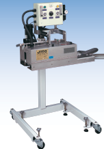
Hot Air Sealers