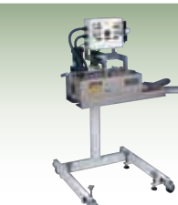
Hot Air Sealers