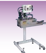
Hot Air Sealers